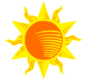
Summer (May 1 - Oct 15, 2023) Pickleball Court Schedule